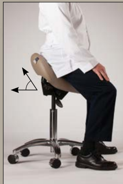
Forward Position Tilt