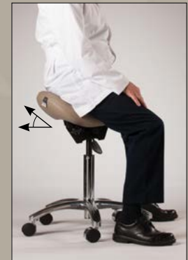
Back Position Tilt