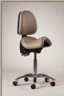
Seat Back (Up Position)